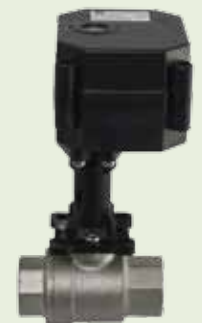
300.0280 to 300.0282