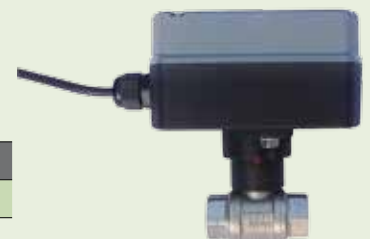
300.0180 to 300.0185