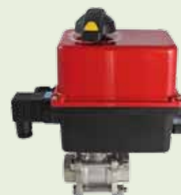
300,0130 to 300,0132

Please order the dirt trap separately; larger modules are available on request