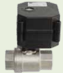
300.0260 to 300.0262

Please order the dirt trap separately; larger modules are available on request