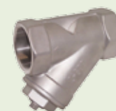
304,0250 to 304,0253