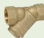
304,0014 to 304,0017